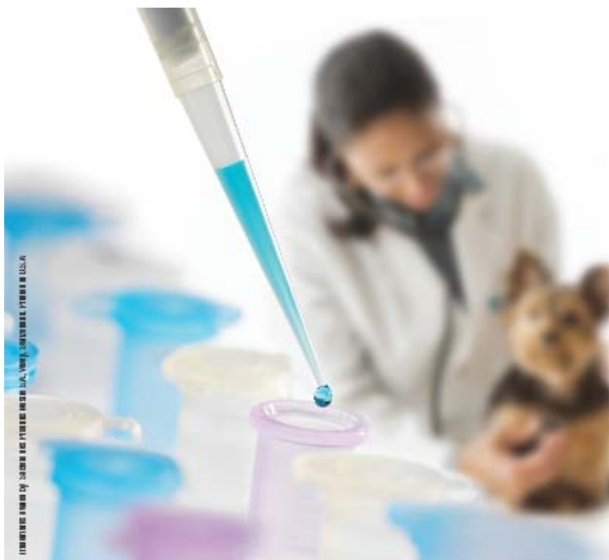
Illustration: © 2011 Purina Animal Health, a division of Purina, Inc. All rights reserved. Purina is a U.S.A.