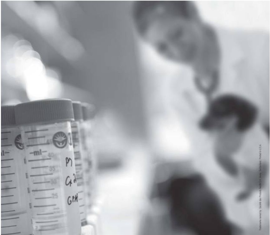
Illustration created by: Scottie de Proust, www.flickr.com, Shutterstock, iStockphoto.com

Purina Farms is located just 10 minutes west of Six Flags outside of St Louis on I-44. Take the Gray Summit Exit & go North two blocks on Highway 100. turn left on County Rd MM & proceed one mile to Purina Farms (entrance is on the left.)