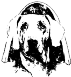
Licensed by the American Kennel Club